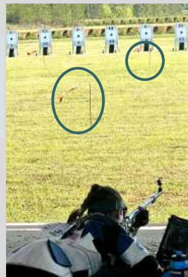
When the wind is constant and the count down clock is ticking!

When hitting ten ring just isn't enough!