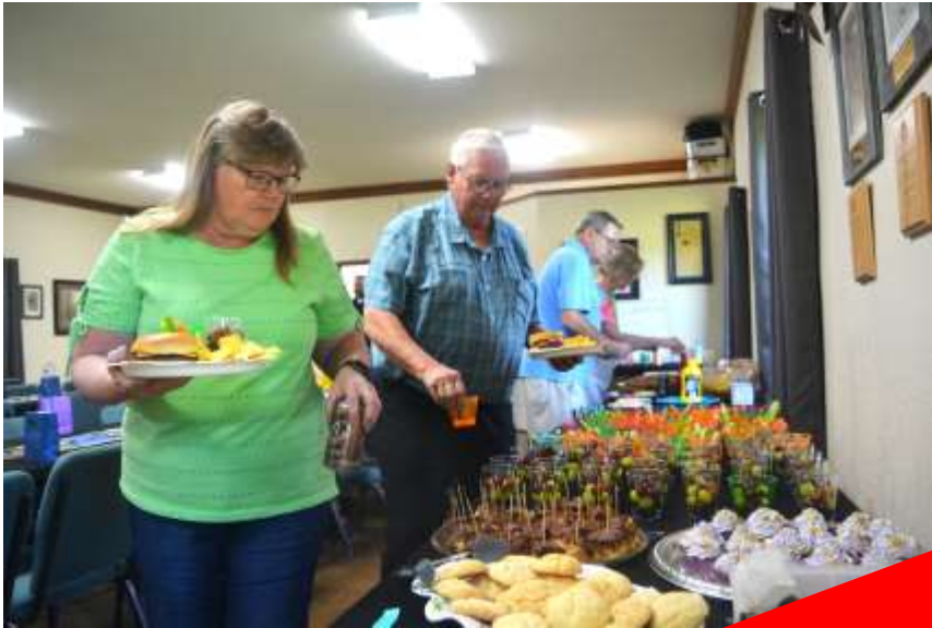
Chamber members moving through self serve food line of delicacies prepared by Chapter Hospitality Team.

CELEBRATING 250TH ANNIVERSARY OF THE UNITED STATES OF AMERICA