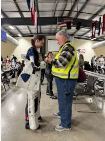
Father/Daughter Prayer before each National Match. Dad also served as RSO for many National matches.