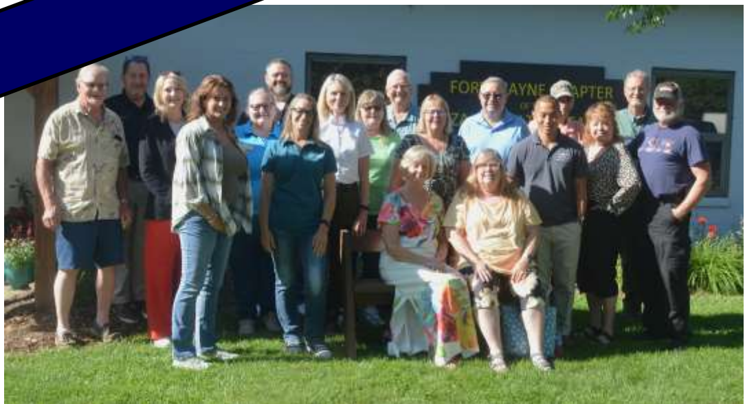
Huntertown, IN Chamber of Commerce members hosted by the Chapter.

CELEBRATING 250TH ANNIVERSARY OF THE UNITED STATES OF AMERICA